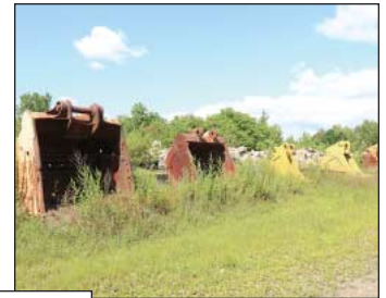
(100+) Excavator and Loader Buckets of All Sizes, Some w/ Grappels