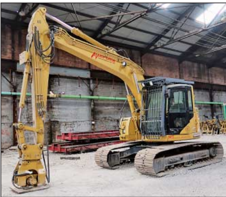
2005 Caterpillar Model 314CLCR Hydraulic Excavator