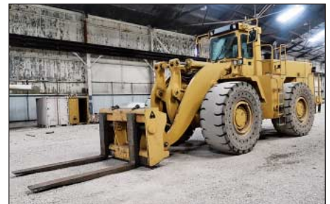
Caterpillar Model 988 Articulating Wheel Loader