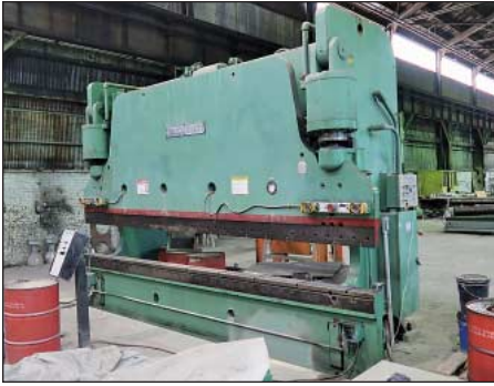
500 Ton x 16' Cincinnati 500FM Series x 14 Hydraulic Press Brake