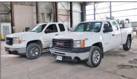
(5) Various GMC Pick-Ups to 2011