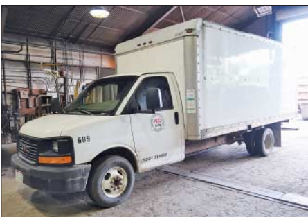
(5) Various Box, Fuel and Lube Trucks