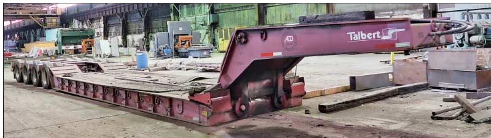
1989 - 85 Ton Talbert Model WITT75HFN Detachable Neck Low Boy Trailer