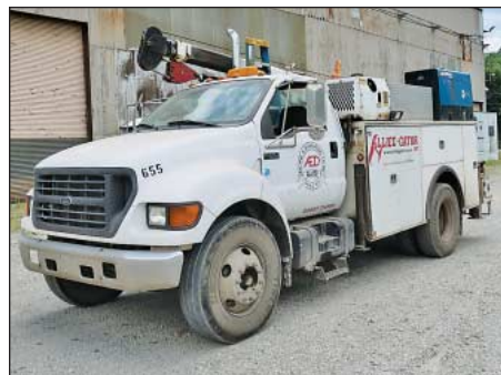
2002 Ford F650 Super Duty Single Axle Service Truck