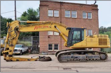
(2) 2002 Caterpillar Model 345 Hydraulic Excavators, Modified for Heavy Demo Use