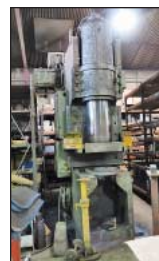
Machine Shop w/ Heavy Welding, Fabricating, Toolroom and Support Equipment