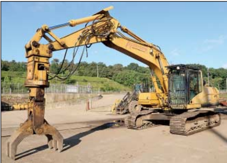
(2) 2002 Caterpillar Model 322CL-ME Hydraulic Excavators