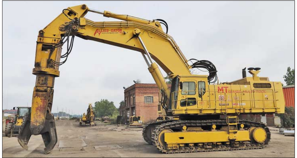
(2) 2000 Komatsu Model PC1100-6H Hydraulic Excavators, Modified for Heavy Demo Use