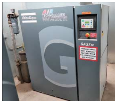
(2) 50 HP Atlas Copco Model GA37FF Air Compressors