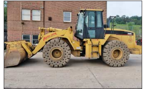
(2) Caterpillar Model 950G Articulating Wheel Loaders