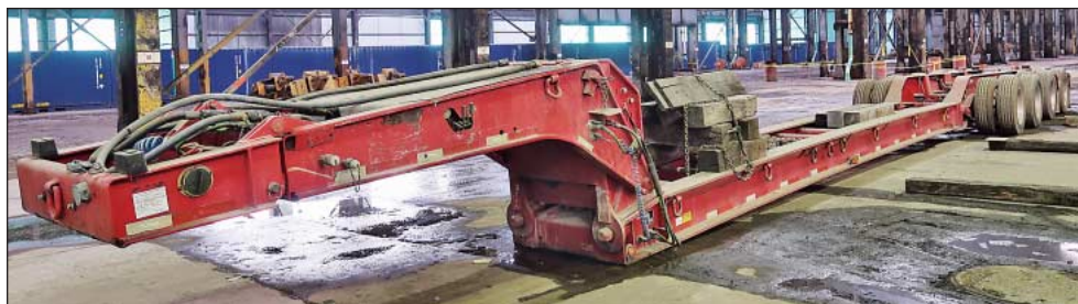
2004 - 45 Ton Talbert Model T4BDW-45-HRG-RA-I-TI Detachable Neck Low Boy Beam Trailer