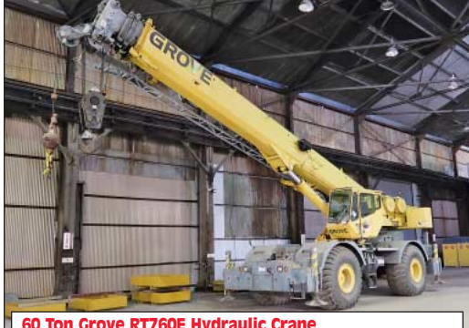
60 Ton Grove RT760E Hydraulic Crane