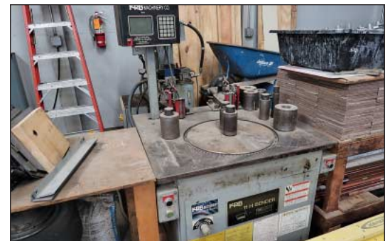
KRB Model 11H Hydraulic Re-Bar Bender