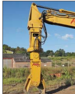
(50+) Excavator Attachments by Allied Gator and Others