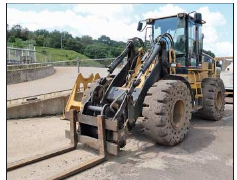
Caterpillar IT28 and IT14 Articulating Wheel Loaders