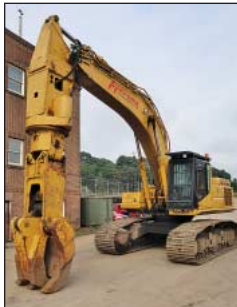
(6) Caterpillar Excavators, Models 345, 322, 314, 308