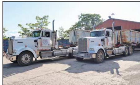
(3) Road Tractors by Peterbilt and Kenworth

1989 - 85 Ton Talbert Model WITT75HFN Detachable Neck Low Boy Trailer; Vin No. 40FW05841K3007973, Hydraulic Detach Feature, Lower Deck 23'6", Deck Over Axels 19', Unit 006 2004 - 45 Ton Talbert Model T4BDW-45-HRG-RA-I-TI Detachable Neck Low Boy Beam Trailer; Vin No. 40FSK58451024181, Tri-Axle w/ Aux. 4th Flip Up Axle, Hydraulic Detach Feature, Lower Deck 44" x 18'6", Deck Over Axles w/ Aux Axle Lowered 44" x 20', Unit 003 2011 - 53' Transcraft Model Eagle Curtain Side Trailer; Vin No. 1TT5332C4B3528389, with Chameleon Rolling Tarp System – Located at the manufacturing building 2006 Transcraft Model DTL2100 Tandem Spread Axle Step Trailer; Vin No. 1TTE4820281083673, Lower Deck 8' x 36', Top Deck 8' x 12', Unit 01-078 2006 Transcraft Model Eagle II Tandem Spread Axle Flat Bed Trailer; Vin No. 1TTF4820162014885 (2) 1999 Clement Hydraulic Dump Trailers; Vin No. 1C9BB30BxxM110461 (Unit 315) and 1C9BB30BxxM110460 (Unit 316) – DAY TBD