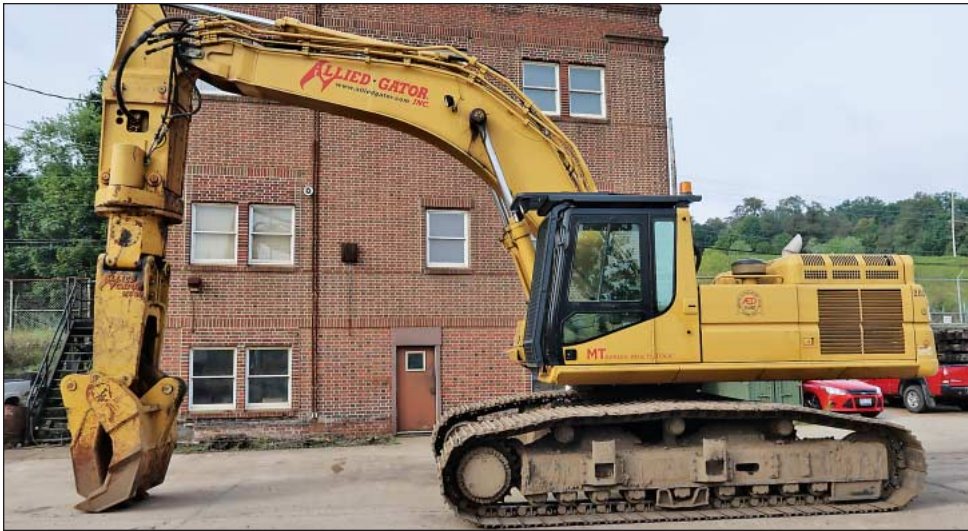
(2) 2002 Caterpillar Model 345 Hydraulic Excavators, Modified for Heavy Demo Use

No. B1E01991 / 209666 with Grapple Attachment, 17,583 Hours, AC in Cab, Unit 330