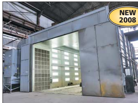
25' x 50' x 18' Global Finishing Solutions Model G8B-2520-DT-50-S Drive-Thru Blast Booth