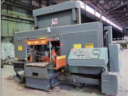
16" x 33" HEM Model WF160LA-DC-C Horizontal Band Saw