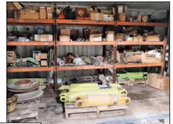
Large Quantity Construction Equipment Parts, Filters, Tracks, Cylinders, Etc.

Steel Curb Forms; Mostly 10' Long, All Necessary Hardware to Set Concrete Forms