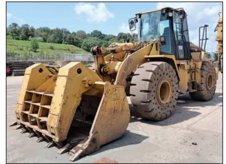
(2) Caterpillar Model 950G Articulating Wheel Loaders

2004 GMC 2500HD Pickup Truck; Vin No. 1FDWE3054WH82463 – DAY 2