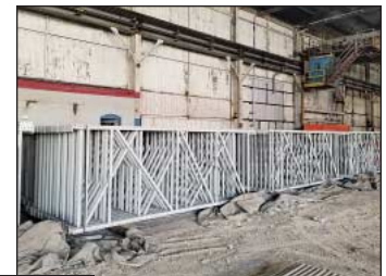
New Never Used Heavy Duty Pallet Rack, (2,000+) Beams and (1,000) Uprights – DAY ONE