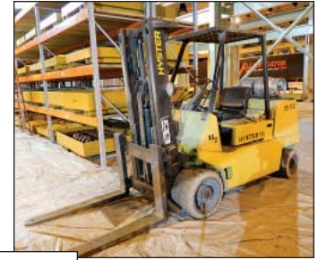
(15) Forklifts by Taylor, Hyster and Cat to 36,000 Lbs. – BOTH DAYS