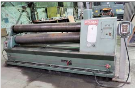
6' x 5/8" Roundo Type PS-255 Plate Bending Roll