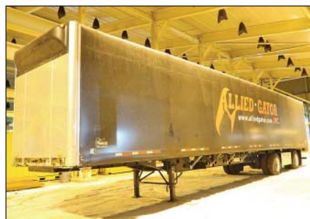
2011 – 53' Transcraft Model Eagle Curtain Side Trailer