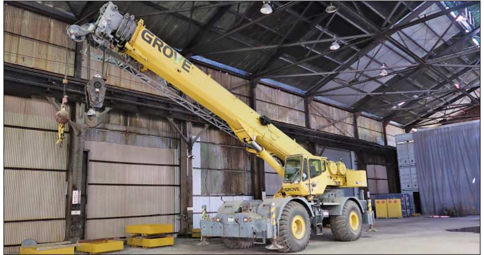
60 Ton Grove RT760E Hydraulic Crane