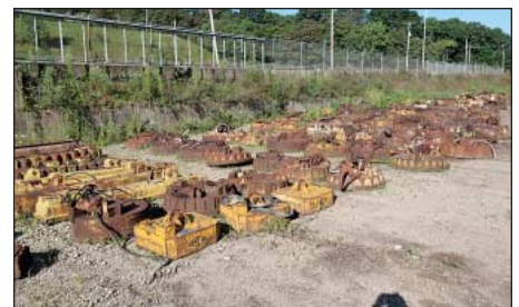
(65) Electric Scrap Magnets of all Sizes and Shapes