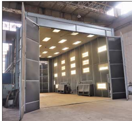
Paint and Blast Booths to 40' x 90' by GFS and Others, New as 2008