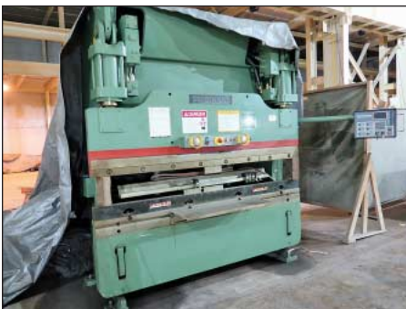
90 Ton x 6' Cincinnati Model 90CBII x 6 Hydraulic Press Brake w/ CNC Back Gage