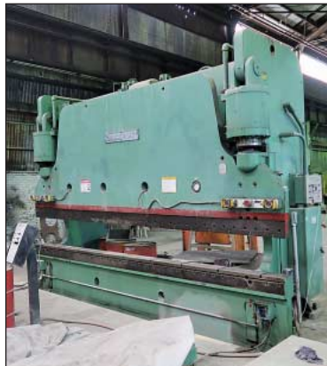
Large Capacity Fabricating and Welding Machinery