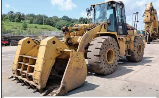
(6) Caterpillar Loaders, Models 988, 950, 268, IT28, IT14