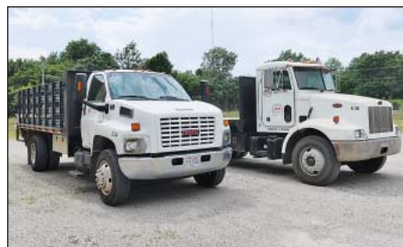
Numerous, Fuel, Lube and Stake Bed Trucks