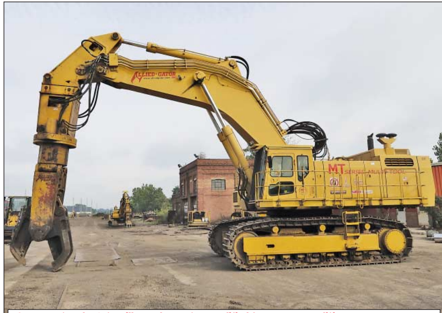
(8) Excavators by Caterpillar and Komatsu, Modified for Heavy Demolition Use

INSPECTION: DAY PRIOR FROM 10:00 AM TO 4:00 PM