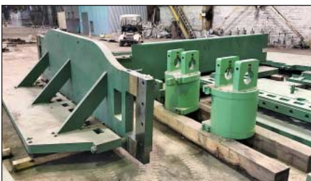
Approx. 1" x 12' Cincinnati Model 8N12 Hydraulic Squaring Shear